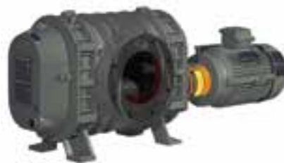
Stokes 6" Mechanical Booster Pump